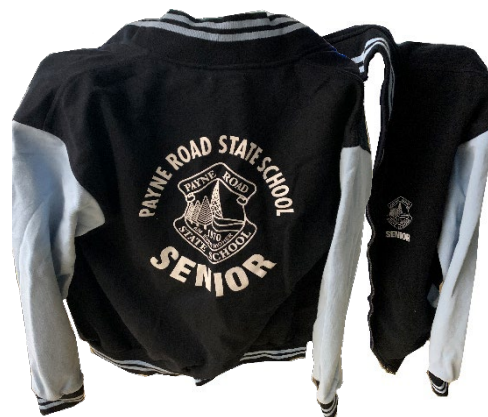
Year 6 Senior Jackets