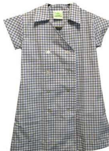
School Dresses are not for Prep